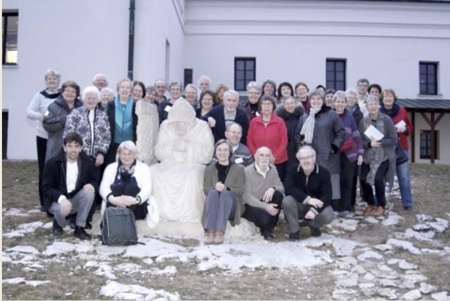
Now the SDE community members gathered around his statue with love, joy and gratitude.